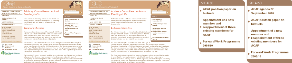
(a) Similar versions